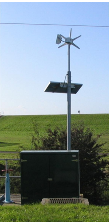
A low energy remote power site where a grid connection would otherwise cost thousands of pounds